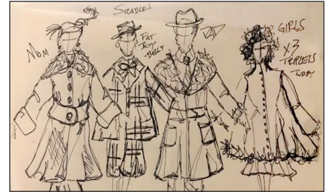
Sketches of Nutcracker costume ideas

As you learned in the beginning of this guide, every version of The Nutcracker is different. There are versions set in 1920s Hollywood, on a sailing ship, at the 1893 World's Fair, during the American Revolution, and across the continent of Africa. Imagine staging this ballet in a different time or place and describe how you'd change the costumes and set.