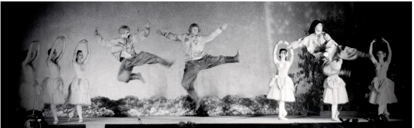
Willam Christensen's 1944 Nutcracker for San Francisco Ballet included many features found in modern productions, such as this lively Russian dance. Christensen had never seen the full ballet when he created his version, but he knew parts of it and got advice from other dancers who knew other parts.

Because it has become so special to audiences, many choreographers and ballet companies now stage their own versions of the ballet.