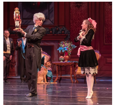
Left: Everyone is dazzled by Uncle Drosselmeyer's collection of amazing mechanical toys that perform to entertain the guests. Right: Drosselmeyer has a special gift for Clara: a beautifully painted nutcracker figure that has a fascinating story to go with it.