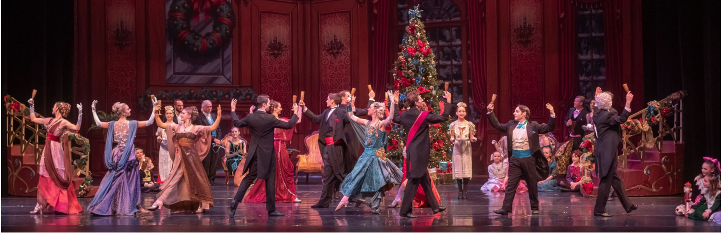
Clara, Fritz, and their parents have invited all their friends to a spectacular Christmas Eve party at their home.

The performance of The Nutcracker that you'll see with your school group has been specially edited into several short modules to fit into your school day. That means you might not see the whole story today – instead, a member of the cast will speak to you before the show starts and fill you in on the whole story and the portion that you will be seeing performed. To make it easier for you to follow along, here's a synopsis (short summary) of the whole story: