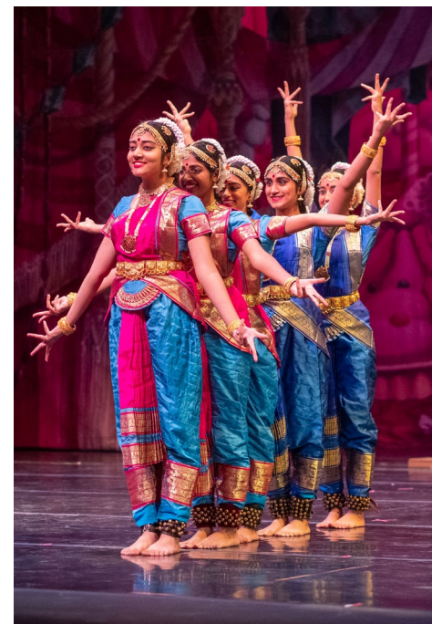
Among the characters Clara meets on her journey are the Sugar Plum Fairy and her Cavalier (top left); the King and Queen of the Snowflakes; a Chinese princess and her dragon; and classical dancers of India.