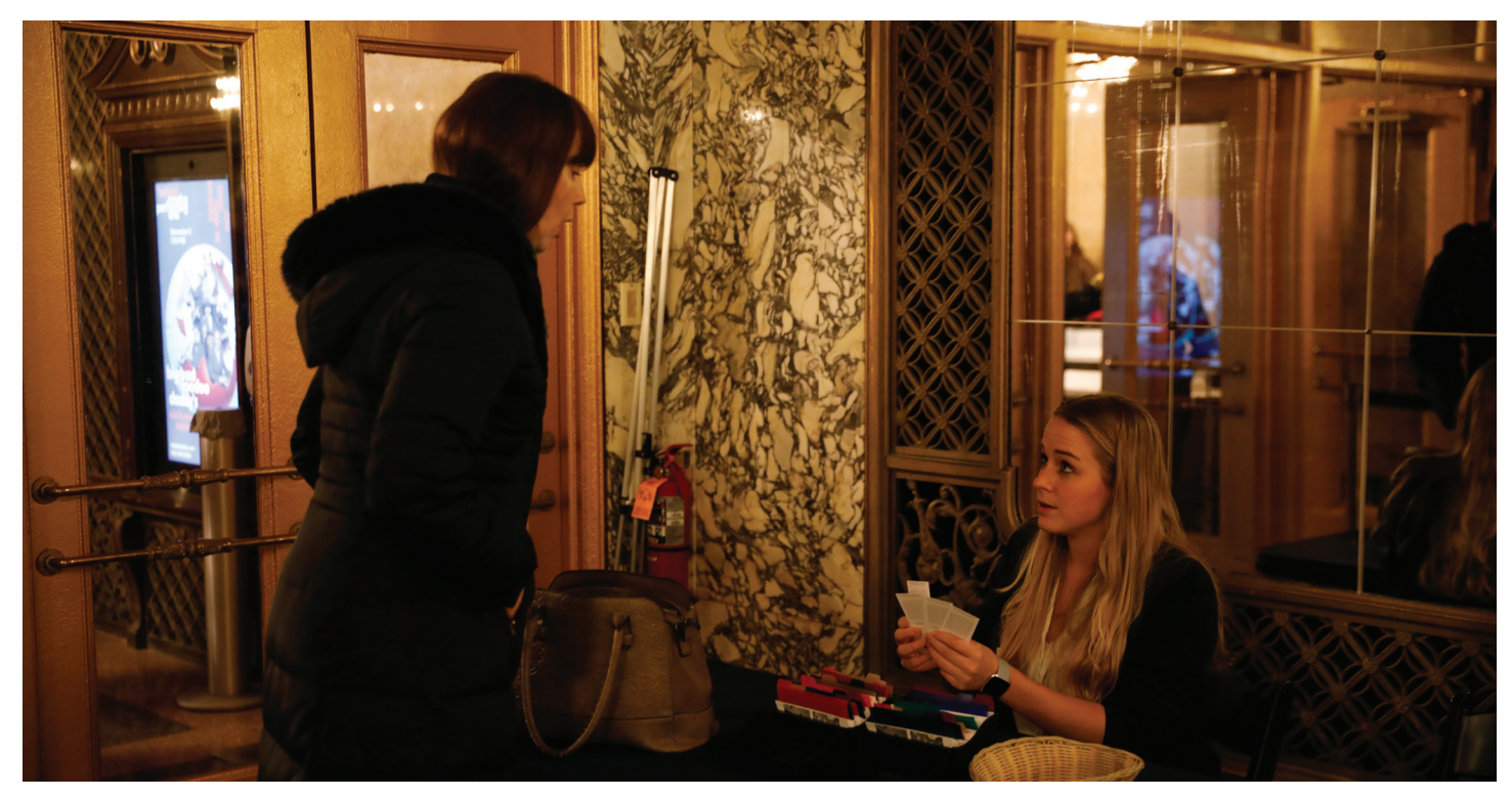
I may get my ticket from someone at Will Call. I can also check out a sensory kit with things such as headphones to help me during the performance.

I may choose to wear a mask when I'm inside the building. I can take it off to eat or drink. When I arrive, I will be greeted by someone at the entrance, who will direct me to the security line. The people in the security line may want to check my bag if I am carrying one.