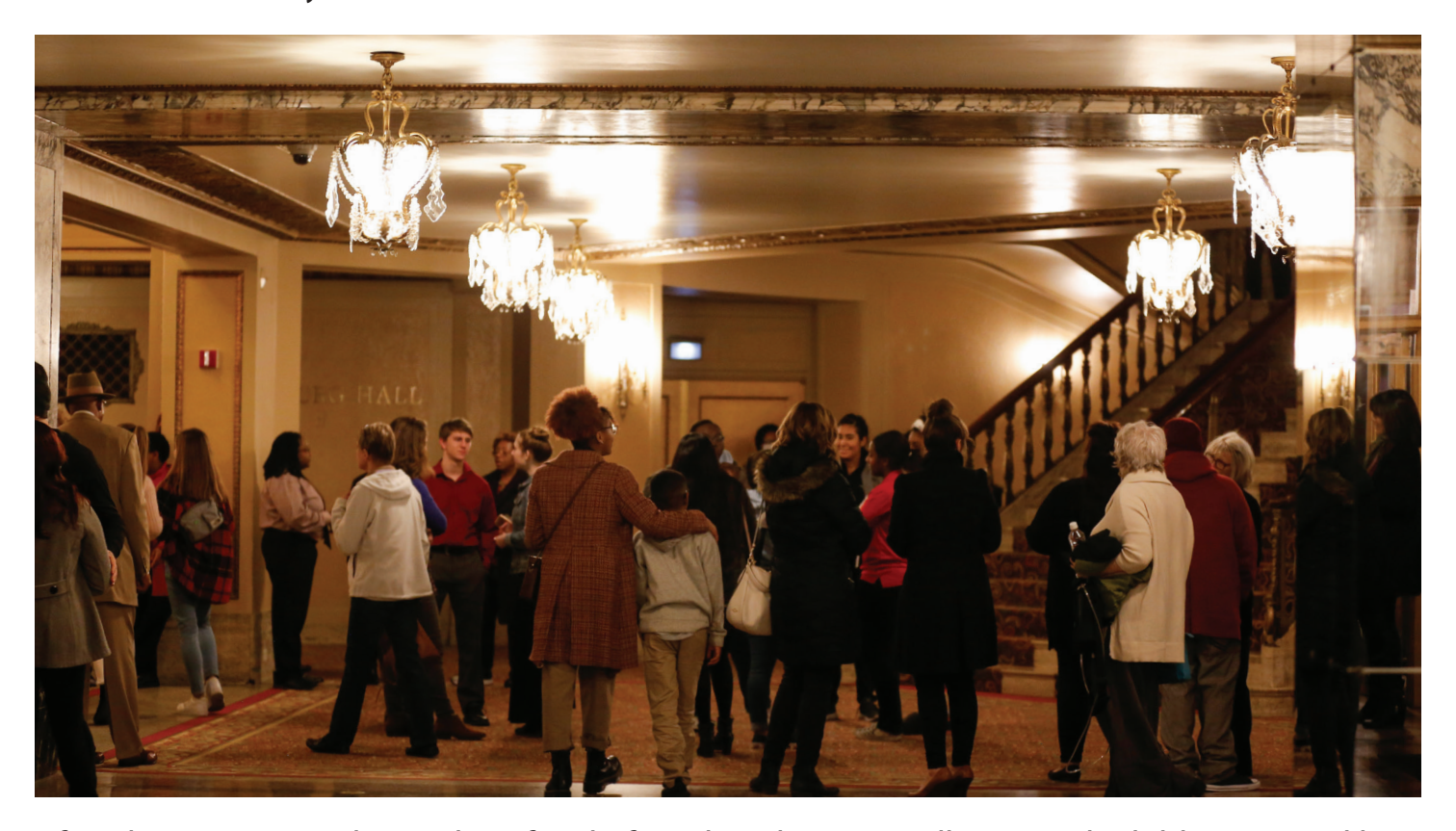
After they scan my ticket and my family/friends' tickets, we will go into the lobby area and be welcomed by the team from Omaha Performing Arts.