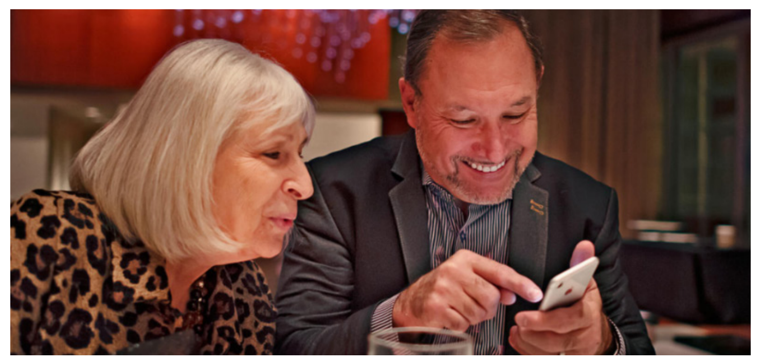
My tickets will be on a cell phone in the Ticket Omaha app. My tickets will be scanned so that I can enter the lobby