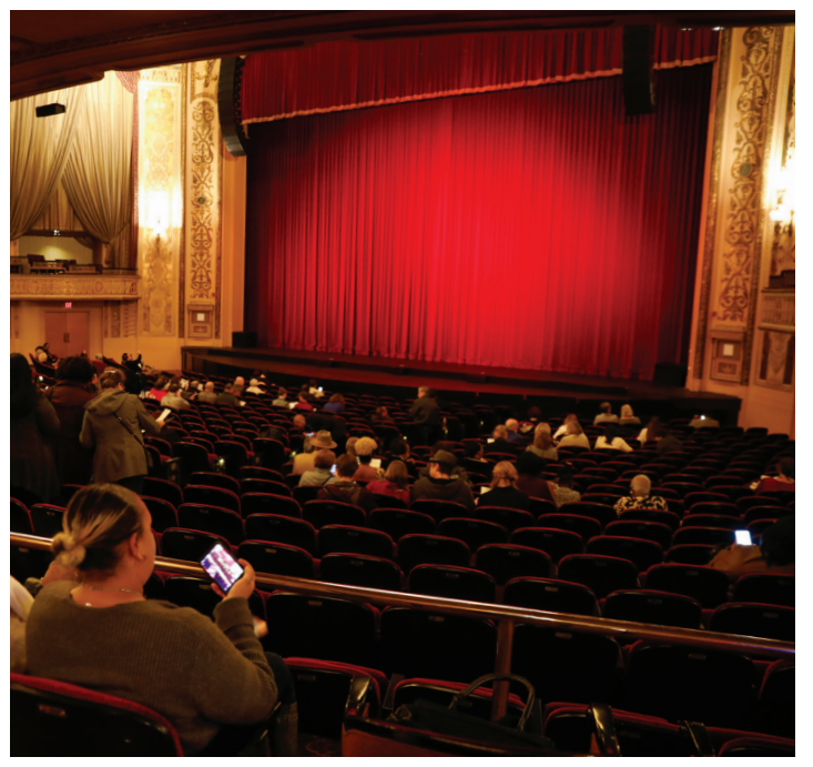
I will sit in my seat and wait for the show to begin. Other kids and their families will also be at the Orpheum Theater. We will all wait together for the show to start.

When I hear an announcement that the show is ready to start, the theater will get darker, everyone will become quiet and the curtains will open.