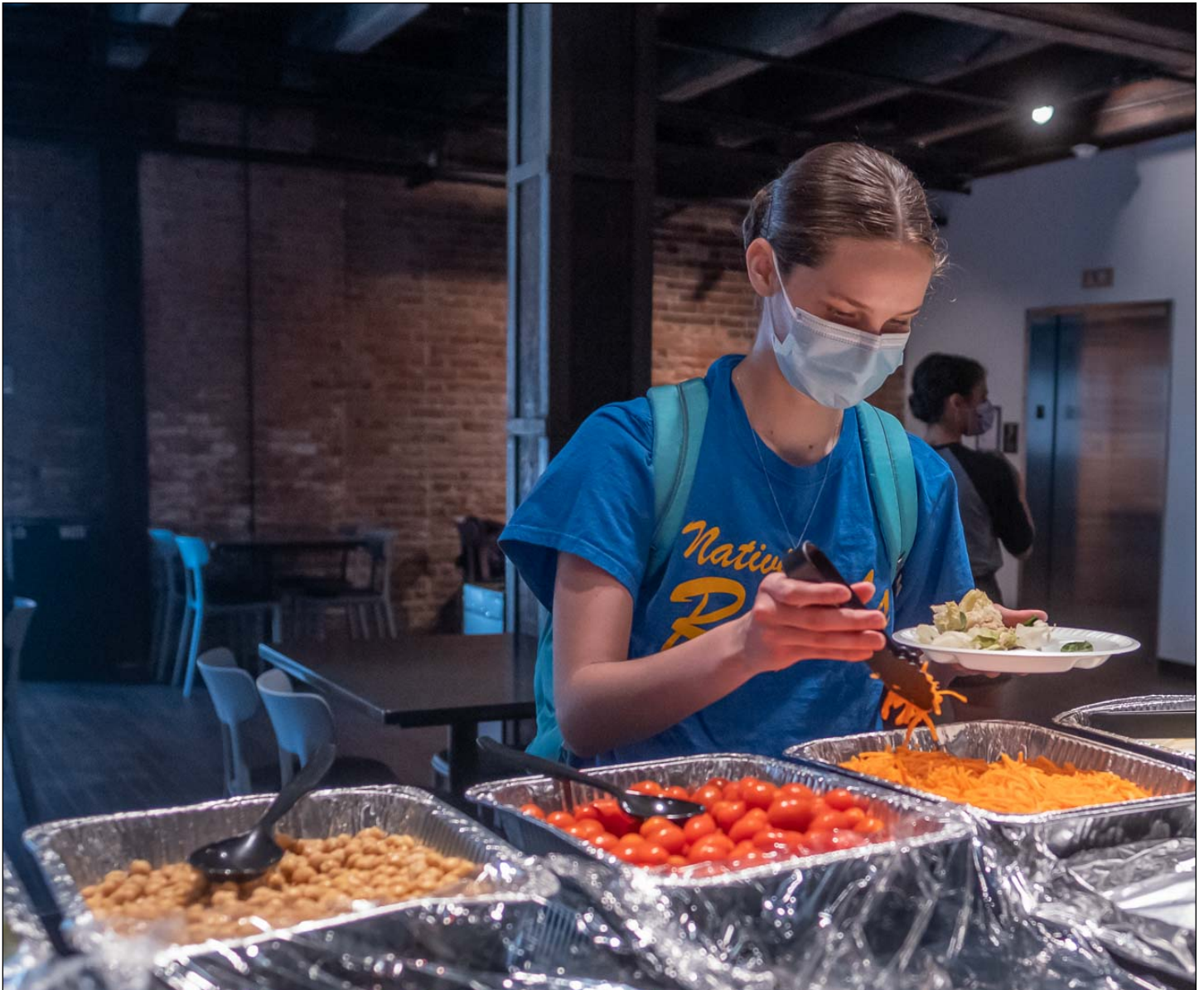
Out-of-town dancers housed at UNO's Scott Campus get a daily catered lunch served in the Hoff Center's event space, McCormick 1894.